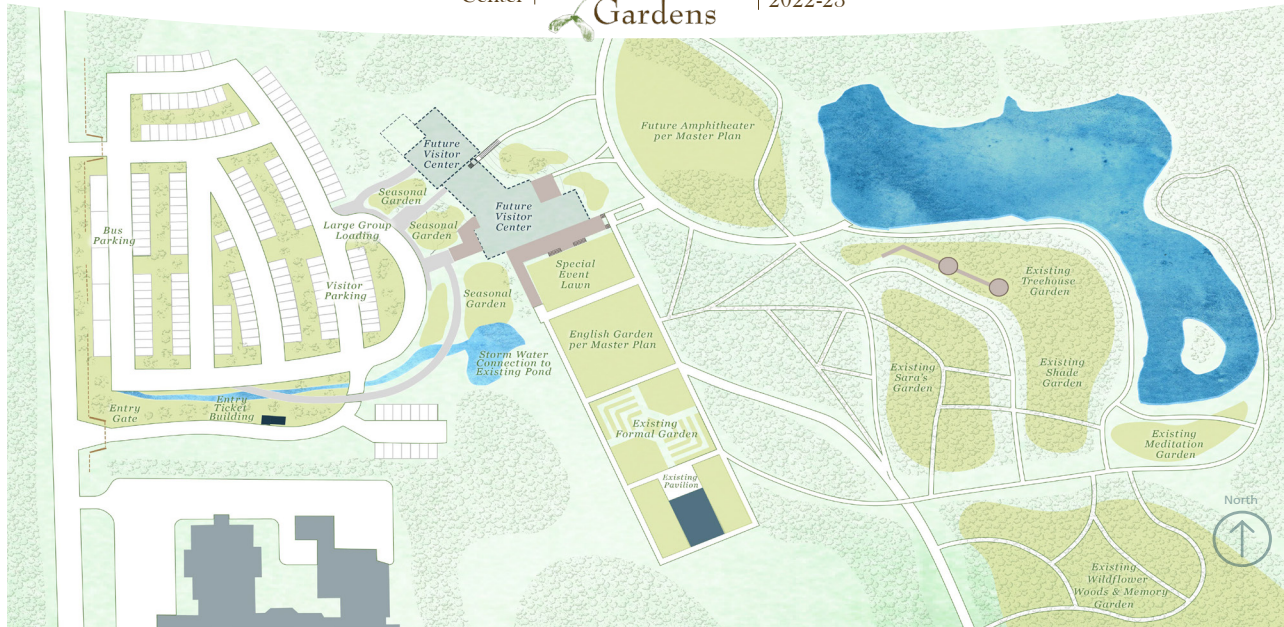
Proposed Site Plan Monk Botanical Gardens | 08.23.2022